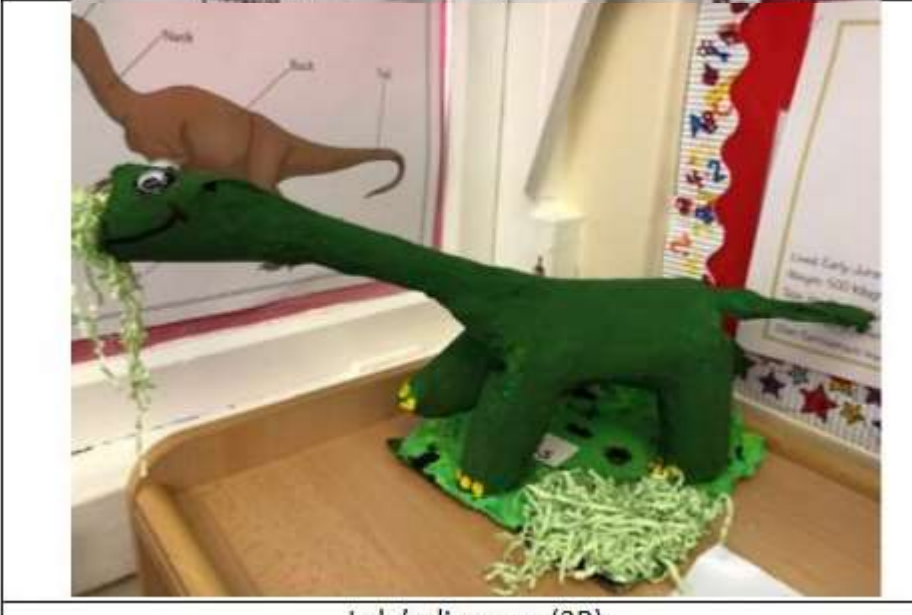
Lola's dinosaur (2B)