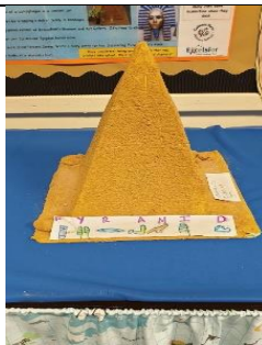
Charley (3T) (Homemade Pyramid)