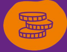
Money & Debt Advice