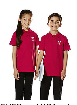
EYFS and KS1 polo-shirts