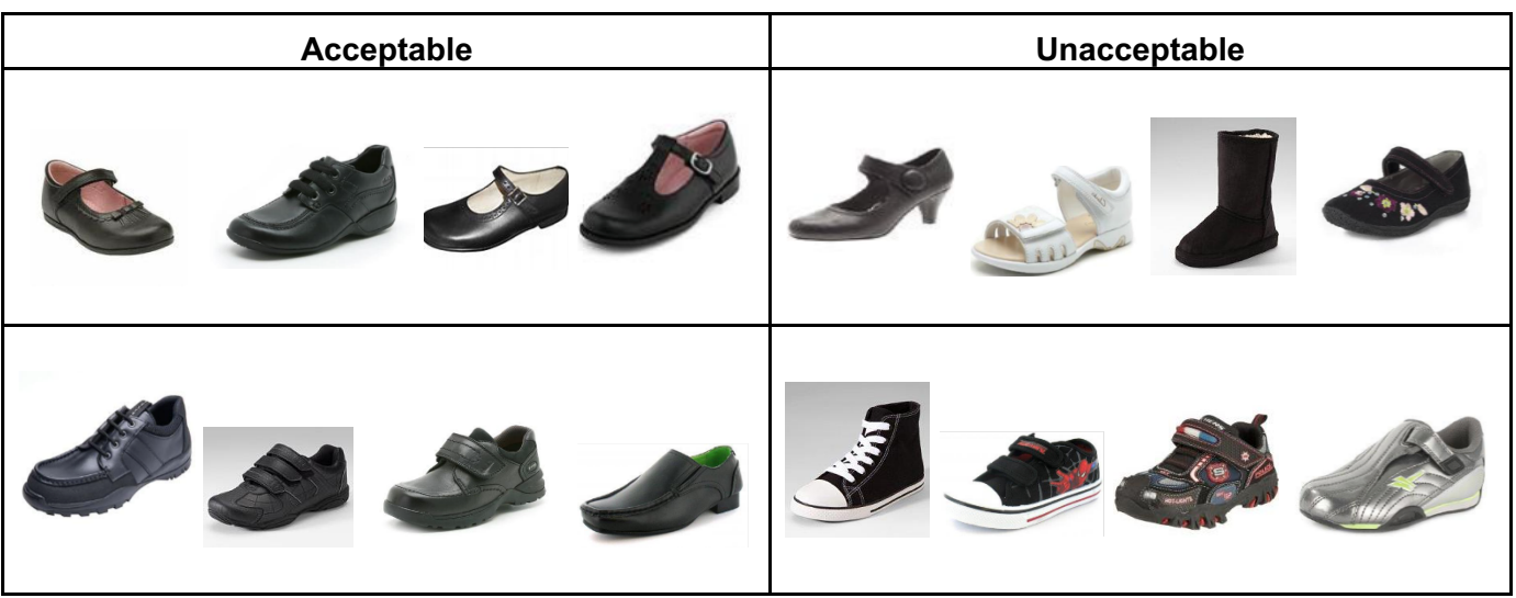
(Please note that this is not an exhaustive list, if you have any specific questions please ask.)