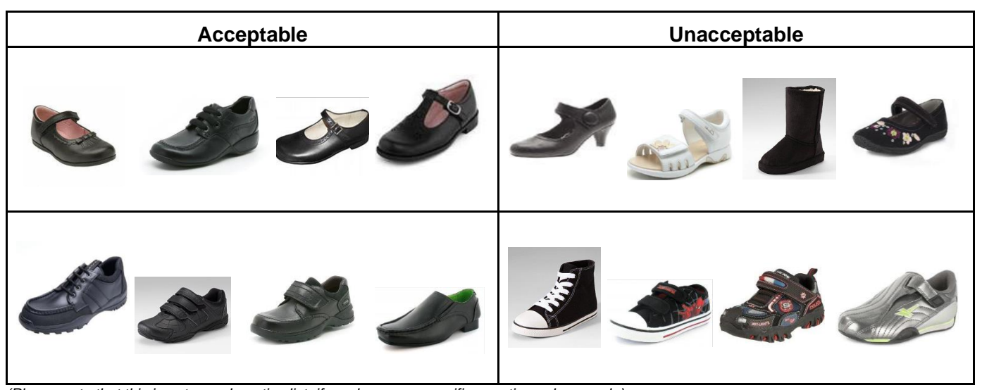
(Please note that this is not an exhaustive list, if you have any specific questions please ask.)