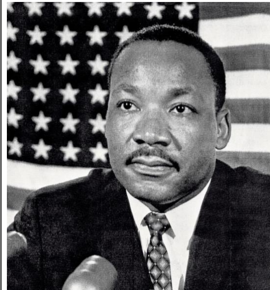
A photo of Martin Luther King

Unfortunately, he was killed in April 1968 for his beliefs. Martin Luther King Day is now celebrated in the USA every January (on the Monday closest to his birthday).