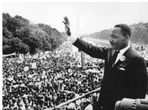
A photo showing the protest in Washington D.C.

'I have a dream that my four little children will one day live in a nation where they will not be judged by the colour of their skin, but by the content of their character.'