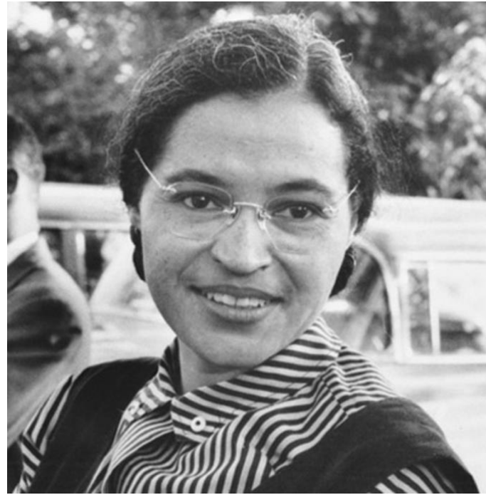
A photo of Rosa Park

On hearing the news of Rosa's arrest, the black citizens decided to boycott the buses (and some white people joined them). The bus company lost a lot of money. Eventually (after 381 days of boycotts) the court decided that that the segregation laws on buses and in other places were not fair and they had to change. Because of this victory, Rosa became known as 'the mother of the civil rights movement.'