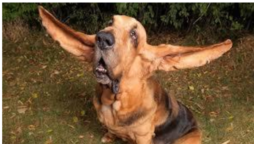
A photo of Tigger - The world record holder for a dog having the longest ears.