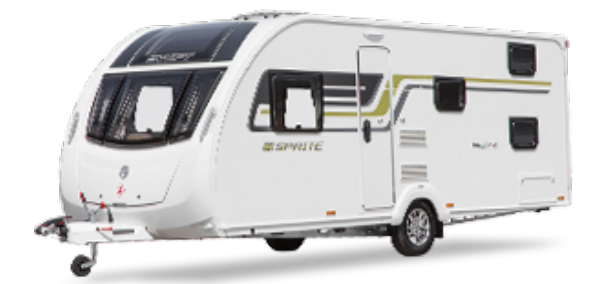
Caravan These houses are special because they can be moved by car to a new place.

Semi-detached Houses These are two houses that are side by side.